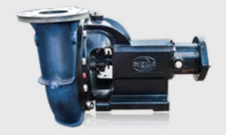
M-4B Standard, CW 306200