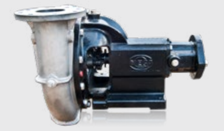
M-4B Corrosion Resistant, CW 306201