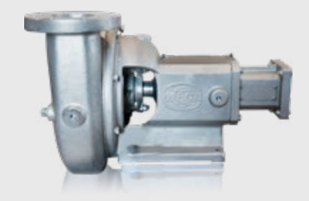
M-4 Complete Stainless Steel, CW 306647

The M-4 series is a clockwise-rotation centrifugal pump with a 6 inch inlet, 4 inch outlet, and maximum speed of 2,400 RPM. Inlet and outlet connections are flanged to provide a solid, leak-proof mount to the tank plumbing. The heavy-duty stress-relieved cast iron frame and volute case provide solid mounting to the tank and more than 1,300 gpm flow (up to 140 psi max).